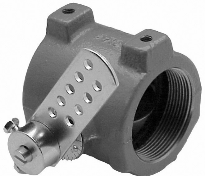
Automatic Butterfly Valve type BVM-A, BVM-AR, BVM-AHD (Shown with Optional Crank Arm / Actuator Not Shown)